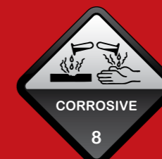
Battery acid is corrosive