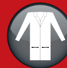
Use acid resistant clothing