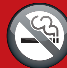
Do not smoke near batteries