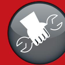
Qualified installation recommended