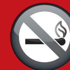
Keep naked flames away from batteries due to risk of explosion