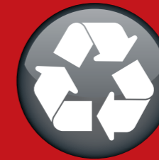
Batteries can and should be recycled