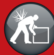
Use care when lifting (batteries are heavy)