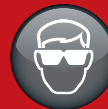
Eye protection recommended