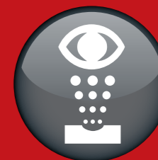
Wash eyes immediately with water